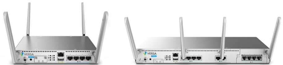
Versa Cloud Services Gateway appliances

The Versa Cloud Services Gateway (CSG) is an appliance that provides the foundation for remote-site and branch connectivity and security, delivering SASE services. The next generation of branch appliances, powered by the Intel Atom® processors x7000C Series, provides high packet processing and throughput performance across network and security functions for seamless connectivity and security with next-generation business agility and TCO.