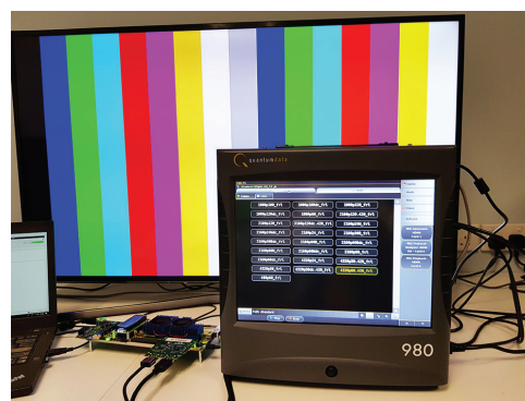
Figure 3. Intel's HDMI 2.1 IP passing QD980 protocol tester 8K data rate