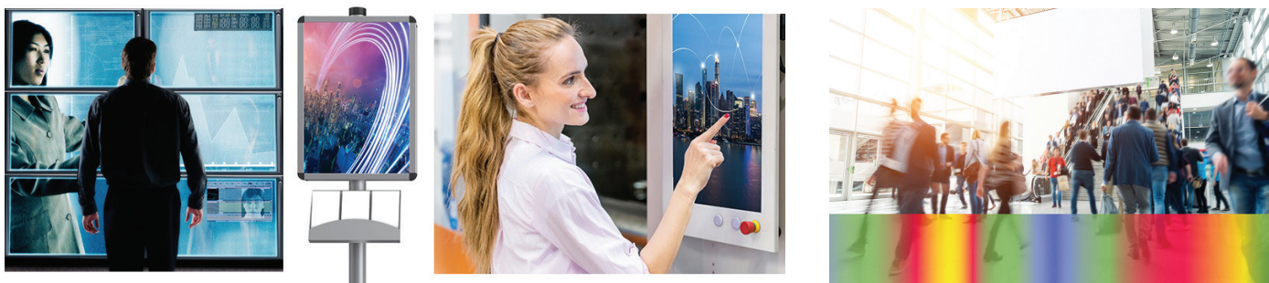
Figure 1. Intel® ecosystem hardware form factors such as interactive display modules, Open Pluggable Specification (OPS+) and FPGA Vision Accelerator Boards enable new requirements and applications in high growth markets such as professional displays or retail.

Intel® FPGAs – with its modular intellectual property (IP) architecture, early-to-market pre-canned IP cores, and ready-to-go reference design hardware – enable original equipment manufacturers (OEMs) to quickly add new features or accommodate end customer specific requirements for a wide range of video markets.