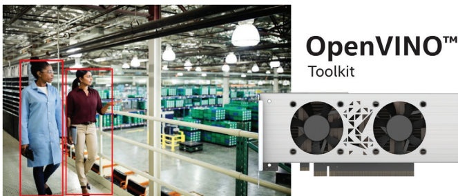
Figure 4. Intel Vision Accelerator Design with Intel® Arria® 10 FPGA

The OpenVINO™ toolkit from Intel is a comprehensive set of deep learning and computer vision libraries that extend across Intel's hardware portfolio to maximize performance in a vast range of different vision applications. Accelerate your vision workloads with Intel FPGA accelerator boards available today supporting large networks up to 4-billion parameters. Get more info at https://software.intel.com/en-us/opencvino-toolkit .